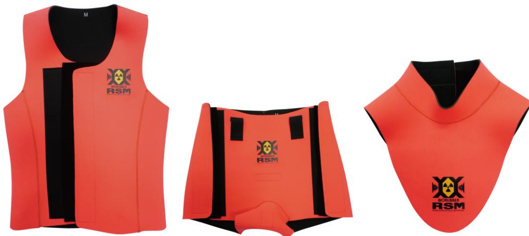
Fig. 3 WP14 suit

The suit covers the genitals and the backbone which are needed to reduce the dose than other parts. Some additional parts are ready to add the suit for protection the important organs. The stabilizer pad which has three layer putting a wet suit material between radiation shielding material is adopted as parts of the disconnection part. Because of this part, for comfort to expand and contract in this stabilizer pad three dimensions direction when the worker move a body in right and left, top and bottom. The stabilizer pad also plays a role which disperses with the weight burden on shoulder on the part of a shoulder feeling weight most. The rubber