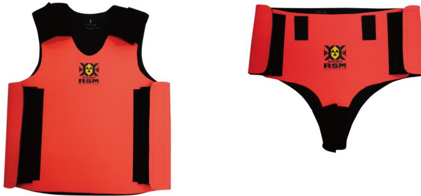
Fig. 2 WP16 suit

suit WP16, and Fig. 3 shows the suit WP14. For the WP16 and WP14, the thickness of the suit and the shielding efficiency to Cs-137 gamma-ray is 1.38 mg/cm 2 and 10%, 0.72 mg/cm 2 and 4.4%, respectively. The neck parts is also ready to wear for the suit WP14.