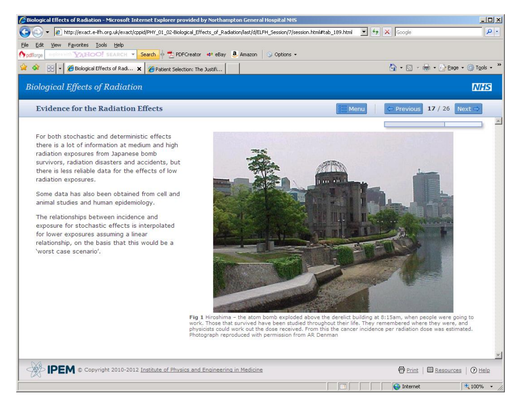
Figure 3 - Screenshot taken from a session built by e-LfH

The sessions were then reviewed and converted into suitable format for learners to access via a dedicated website hosted by e-Learning for Healthcare (e-LfH). <u>www.e-lfh.org.uk</u>. A screenshot of a page in one of the sessions hosted by e-LfH is shown in figure 3.