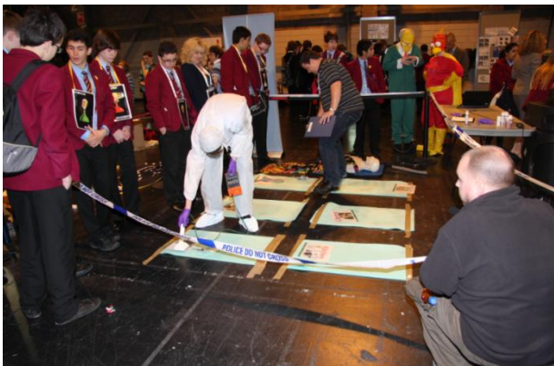
IRPA13: Students event

As well as having the full scientific programme, we really wanted to weave our theme Living with Radiation – Engaging with Society into the Congress. This aimed to help delegates become more comfortable in communicating with our wider stakeholders, who are often somewhat fearful of radiation issue, and to share the experiences of communities which have been impacted by radiological issues. In living up to our theme we also arranged a special one day programme for schoolchildren. Planning for this, which was led by SRP, began with an expectation of a few hundred children coming to the venue, but the response from the local community was so overwhelming that we had to close the doors at 1200 13/14 year old students. The atmosphere around the venue on that day was almost overpowering!