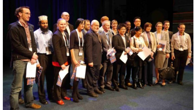
IRPA13: The Young Professional's Award.

are currently not many of such groups. Hence it is vital to inform the different AS that today it is most important to have such groups, because the overall membership of the AS within IRPA is growing old and we need to have more young blood coming in. This is work in progress.