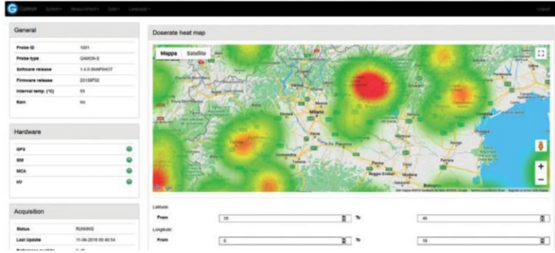
Figure 3: Web page to visualize the count rate, dose rate or isotope presence in the form of a heat map.

The web application for the network is an intuitive and easy handling tool for the operator to supervise all intelligent radiation monitoring systems deployed in the field by a user-friendly web interface. The intuitive graphical interface allows the user to fully control the situation guaranteeing fast and reliable decision making for prompt emergency response. The software visualizes all the network of systems on a map showing the status of all deployed systems and the radiological situation, alerting the operator in case of alarm. The dosimetric heat map is obtained using data fusion algorithms using real time measurements for all georeferenced systems (Fig. 3). The network software is the perfect tool for wide area coverage applications or the monitoring of sensitive locations or events to have a safer and clearer monitoring overview.