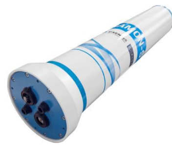
Figure 5: Picture of the gamma radiation spectroscopy system for realtime radiation monitoring.

The gamma radiation spectroscopy system represented in Fig. 5 is designed for early environmental warning and emergency response. It runs automatic real-time analysis of surrounding gamma emitting isotopes for detecting radiological threats. On-field installation allows the system to easily monitor wide surrounding area, detect small deviation from natural. background thanks to the high detector efficiency, to provide detailed reports on the radioisotopes found. It has been designed and assembled with a robust case designed to guarantee IP68 and for operating outdoor in extreme weather conditions from -40 to +60 °C. To be operated as a station it mounts batteries, optional solar panels and is provided with wired and wireless communication interfaces: USB 2.0, Ethernet, WiFi and 3G/4G LTE.