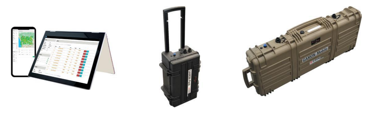
Figure 6: Picture of the portable and discrete radionuclide identifier (left and middle) and of the vehicle mountable gamma spectrometric system in its rugged case (right).

The vehicle mountable gamma spectrometric system (Fig.6 right) is embedded in a rugged and IP66 container designed to resist to external stresses (e.g. shocks and vibrations) and easy to mount and fix on the vehicle chosen for the inspection (boat, helicopter or car), with rechargeable batteries for extended operation. It is designed to make radiometric measurement and identification of gamma emitters on wide areas providing a map of the radioactivity detected. The real time identification algorithm can recognize artificial gamma emitters beyond the natural background and mark the hot spot over the trajectory travelled by the moving vehicle. This feature allows the user to make a map of the radioactivity of the scanned area.