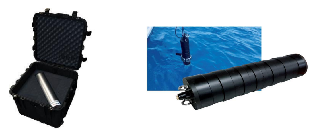
Figure 7: Picture of the compact radionuclide identification unit in its rugged transportable case (left) and of the underwater system for radionuclides identification and an on-field use of the system for monitoring the sea contamination (right).

The underwater system for radionuclide identification, represented in Fig. 7 (right), is specifically designed for submerged radiometric measurement and radiological alerts. The system can be used as a quick response measurement device, or it can be installed as a permanent monitoring device for sensitive underwater locations or for oil&gas applications. The submersible hermetic case and its weight allow an easy gamma spectroscopic measurement in real time from small boat or watercraft. The system was designed to offer the best combination of portability, low power consumption and performance.