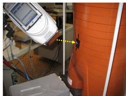
primary beam, dosimeter fixed in 10 cm distance on an Alderson phantom