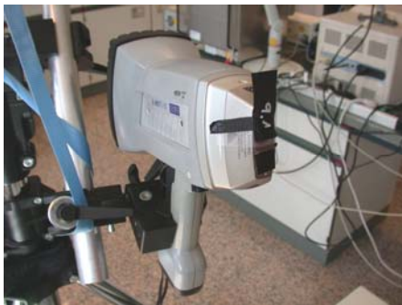
primary beam, dosimeter fixed on the surface of the exit window