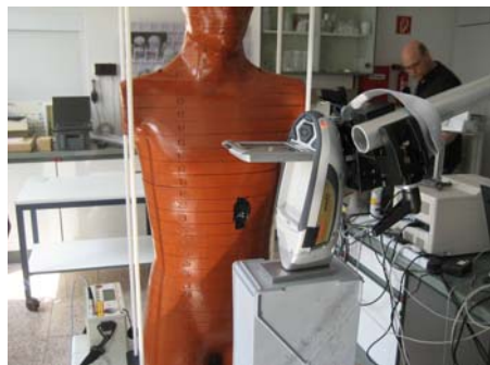
scattered radiation on steel, XRF fitted on the probe surface