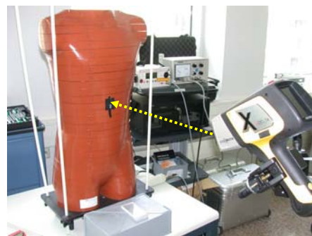
primary beam, dosimeter fixed in 100 cm distance on an Alderson phantom