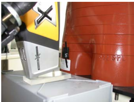
scattered radiation on acrylic glass, XRF tilted to the probe surface