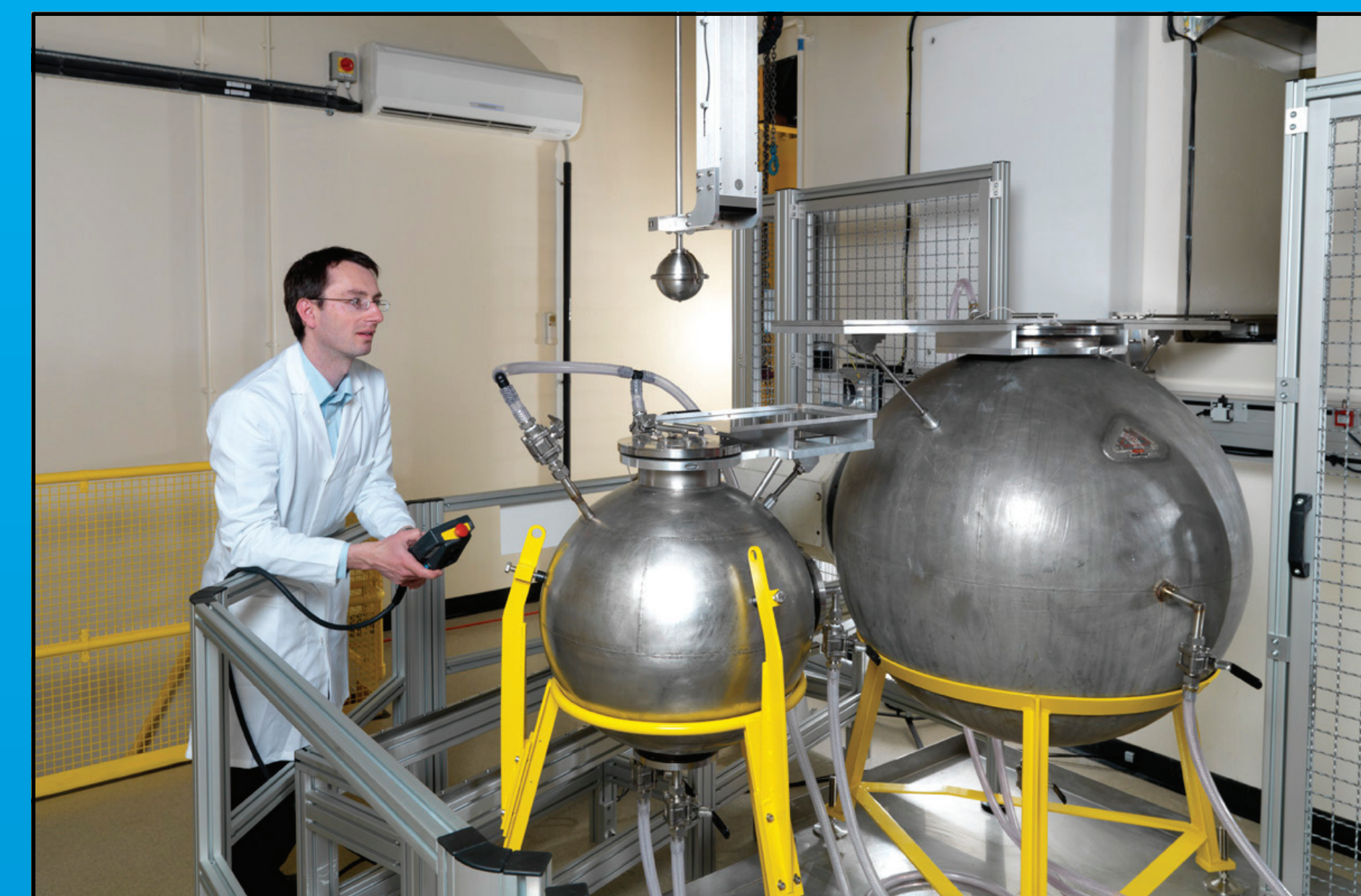
Figure 4: The manganese bath (large tank right of centre) is used to measure the output rate of sealed radionuclide neutron sources to high precision. The source is mounted in a small stainless steel sphere, which is then evacuated and transferred by a pre-programmed transport system to the centre of the bath.

The source under test is placed inside a small stainless steel sphere and transferred under remote control into a 1 m diameter bath of manganese sulphate solution (Figure 4). The neutrons activate the manganese, and this activity is measured by pumping the solution past sodium iodide gamma detectors in an adjacent room. The output rate of the source can then be calculated.