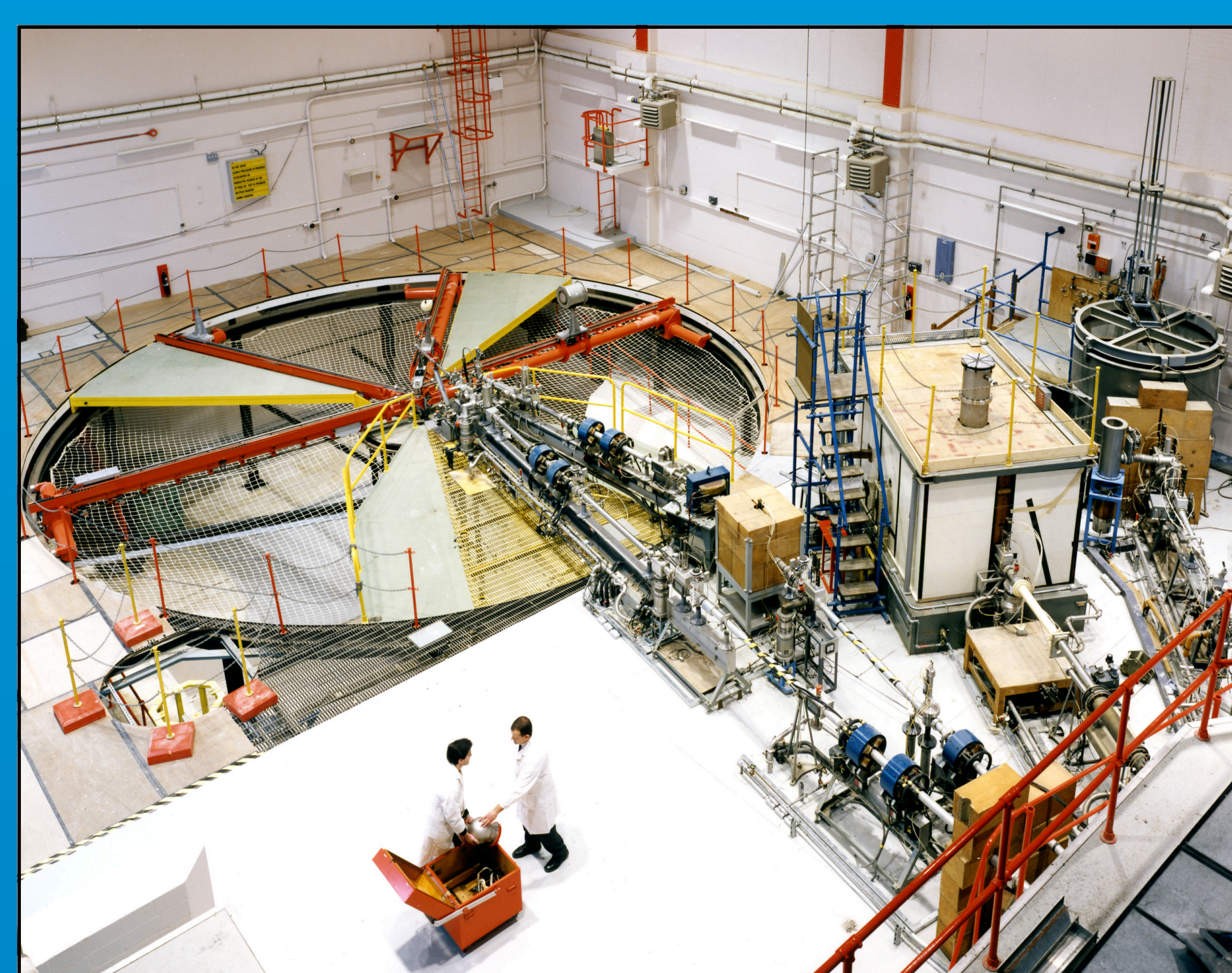
Figure 1: The main experimental area, measuring approximately 18 \times 18 \times 26 m. A Van de Graaff accelerator behind the shield wall (lower right) provides ion beams for neutron production in the low-scatter area (centre left) or the thermal pile (centre right). Alternatively, radionuclide neutron sources may be mounted at the centre of the low-scatter area.

This presentation describes some recent developments in neutron metrology and dosimetry at NPL.