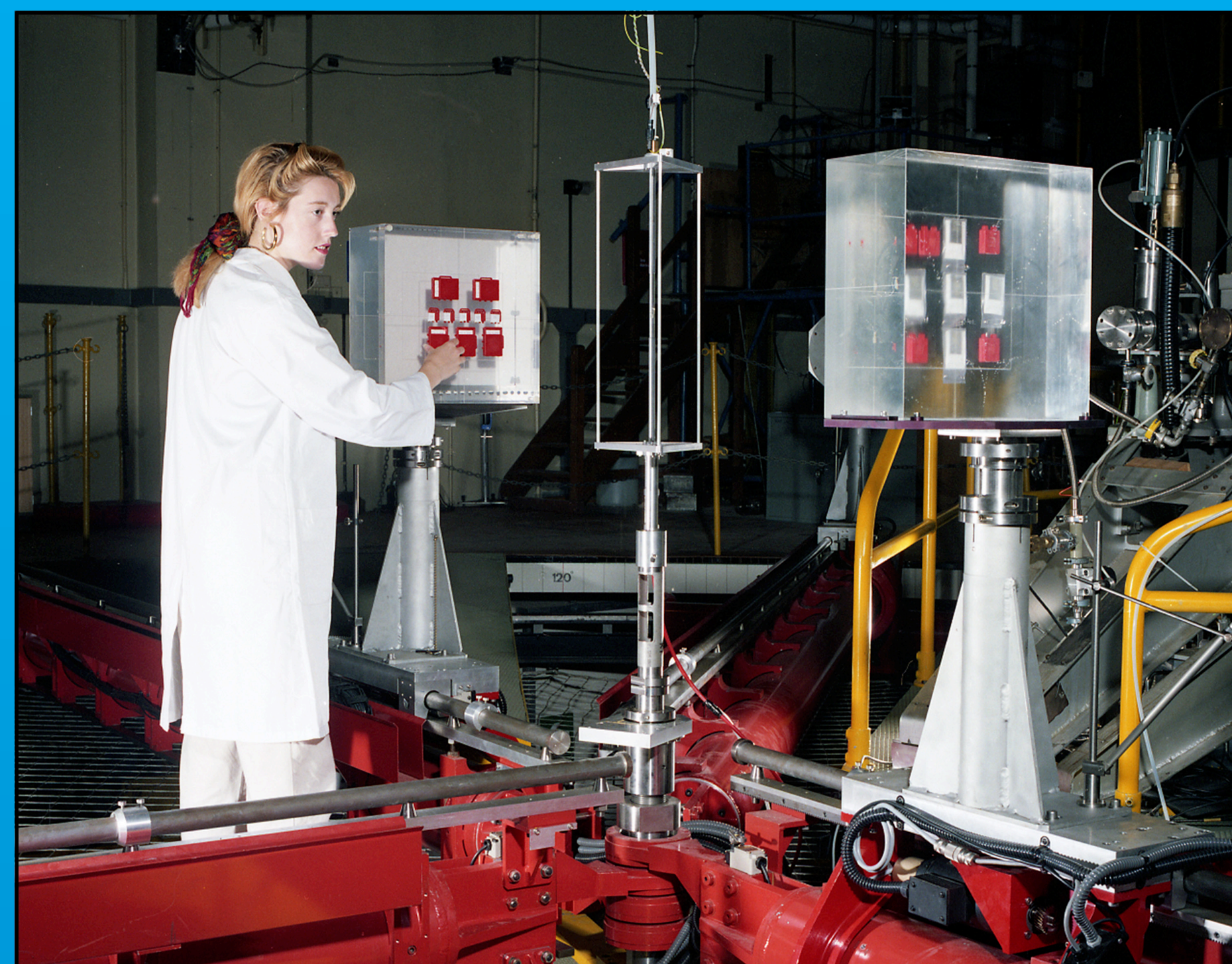
Figure 3: The pneumatic transfer system for the high-output ^{252}\text{Cf} source ( 3.3 \times 10^8 neutrons per second into 4\pi , calculated for 31st May 2012).

As an alternative to monoenergetic neutrons, well-characterised broad-spectrum fields (including simulated workplace fields) may be produced by substituting a thick target or by removing the final section of beam line completely and mounting a radionuclide source instead. NPL has a range of such sources, including at present a particularly high-output ^{252}\text{Cf} source that produces 3.3 \times 10^8 neutrons per second into 4\pi , corresponding to a personal dose equivalent rate of 3.8 \text{ mSv h}^{-1} at 1 m. A pneumatic transfer system (Figure 3) has recently been installed to bring this source to the irradiation position remotely.