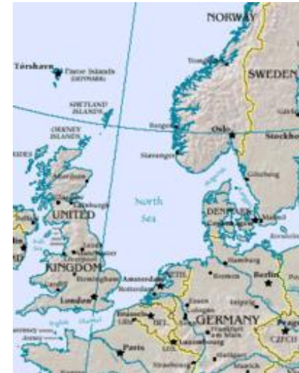
North Sea area