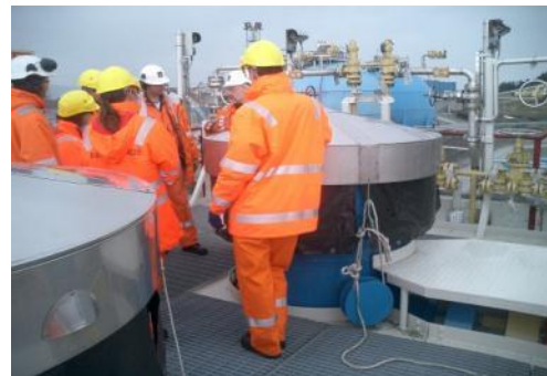
Oil and gas industry workers dealing with NORM