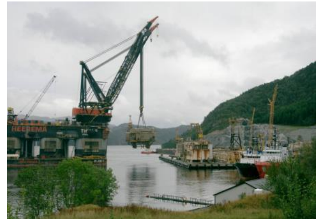
Onshore decommissioning