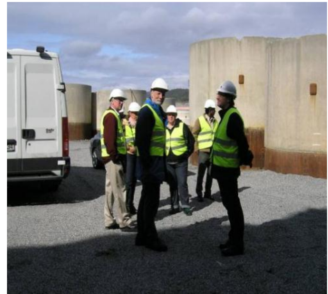
The group on a visit to the Norwegian repository for NORM waste