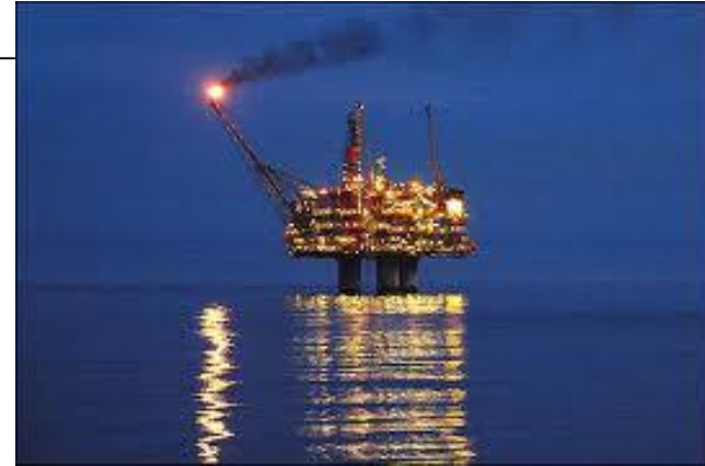
Platform in operation