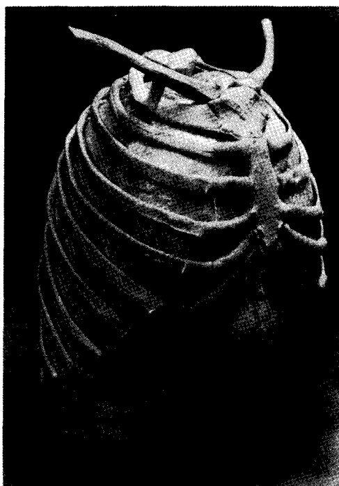
Fig. 1. Plaster mandrel of torso interior with simulated bone rib cage in place.